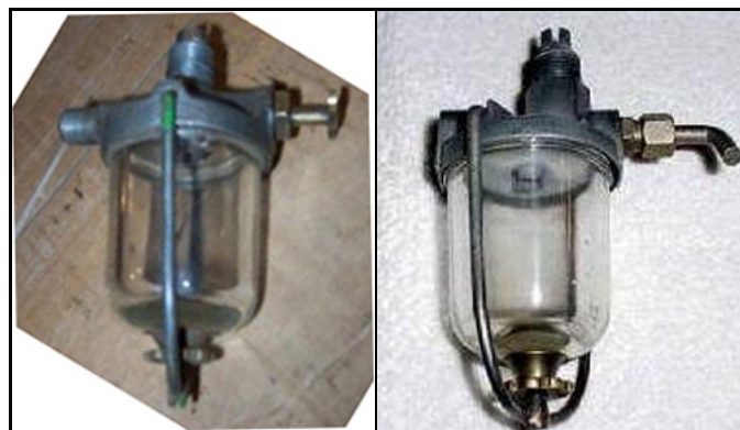
Figure 2 (A&B). AA499R on the Left (A), AA5334R on the Right (B). Note Offset of roughly 1/2-inch off-center in AA5334R of tank fitting.

If any of you went to your Deere dealer in search of a new AA499R Fuel Filter Assembly, you most likely come away with something different. JD literature shows AA5334R plus 29H598R close nipple as the suitable replacement. The problem is that the inlet fitting (top) of the AA5334R is offset from center by 1/2 inch which, in turn, forces the 3-way fuel cock 1/2 inch closer to the drip edge of the hood -- making wrench access to the packing nut of the 3-way fuel cock impossible on some models without cutting a notch in the hood! Thus, the motivation to save the old assembly becomes a higher priority than before!