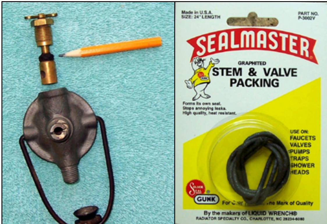
Figure 1(A&B). At left (A) we have AA499R without Glass bowl, depicting centered fuel tank fitting and with a pointer indicating the worn, hardened packing. On the right (B), we observe a sample of graphite packing commercially available at some hardware stores of a plumbing supply outlet.

Here we have the fuel shutoff portion of the original AA499R Fuel Filter Assembly. Note this is a "gate" type valve, with "tee-handle" vertical for "on," and horizontal for "off." With this gate valve, 1/4 turn is needed to go from ON to OFF, and vice versa. Over the years, the rotating part of the valve wears so that its fit is less than optimal, and the packing has become dried, shrunken and hardened after some 60 years on the job.