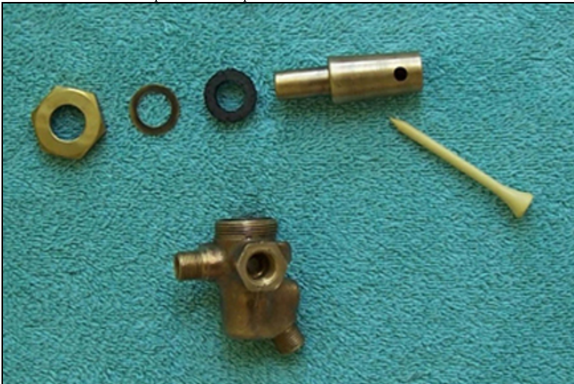
The Parts of the 3-Way Fuel Cock (Minus the golf tee!)

TIP -- If you find this unit is frozen up, remove the brass packing nut washer and packing, reinstall the packing nut, and subject the unit to some serious heat. Even a stint on the hot BBQ pit will work, and when it has cooled down, the parts should separate with ease.