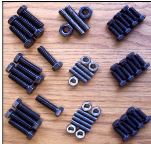
Styled JD-D (D143800-up)