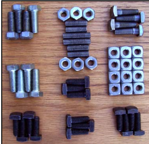
Model H, All Serial Numbers