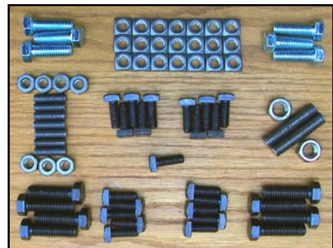
Model "R" Tractors (R1000-up)